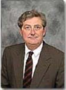
Honorable John N Kennedy State Treasurer